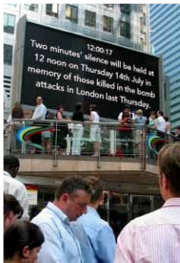
Office workers at London's Canary Wharf observe a two-minute silence in memory of the victims of the July 7, 2005, bombings one week after the attacks.

Radical Islamist movements also differ from broader currents of Islamist activism, such as that represented by the Muslim Brotherhood. While the movements share certain ideological roots, followers of the Islamism associated with the Muslim Brotherhood are, for the most part, committed to working within existing political and legal systems. Indeed, Islamists and jihadists increasingly find themselves at odds rather than working in consort. In fact, some Brotherhood-linked groups have worked with European security services to curb the influence of radical groups. In addition, several new Muslim organizations – including the Quilliam Foundation in London and British Muslims for Secular Democracy –