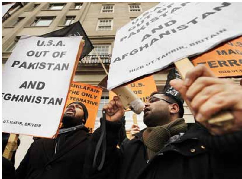
Members of Hizb ut-Tahrir stage an anti-war demonstration outside the London Conference on Afghanistan, held at Lancaster House on Jan. 28, 2010.

Hizb ut-Tahrir never managed to gain a mass following in the Middle East and was largely driven underground in the Arab world due to hostility from secular regimes touting Arab nationalism. Nevertheless, the group has developed a strong presence in Europe, particularly in the U.K. and Denmark. It also has a significant following in Germany, in spite of being banned in that country since 2003 on charges of anti-Semitism.