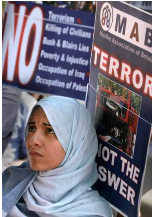
A Muslim woman at a rally in London on July 17, 2005, organized by the Stop the War Coalition and the Muslim Association of Britain.